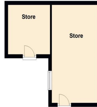
Ground Floor Approx. 71.2 sq. metres (766.6 sq. feet)

Money Laundering Regulation: People who intend to purchase will be asked to show us documents to prove their identity. This will allow us to agree the sale and move forward with your purchase as quickly as possible. 2. We do our best to make sure our sales particulars are as accurate and reliable as we can. However, they are a general guide to the property and if something is particularly important to you, we will be happy to check information for you. As regards measurements, the approximate room sizes are intended as a general guide. You must verify dimensions of rooms yourself before ordering any carpets or furniture. 3. As regards services, we have not tested the services or any equipment including appliances in this property. We advise prospective buyers to carry out their own survey, service report before making their final offer to purchase. 4. This sales information has been issued in good faith. However, it does not constitute representation of fact or form part of any offer or contract. The information referred to in these particulars should be independently verified by any prospective buyer or tenant. Neither Nest Estates nor any of its employees has the authority to make or give any representation or warranty whatever in relation to this property.